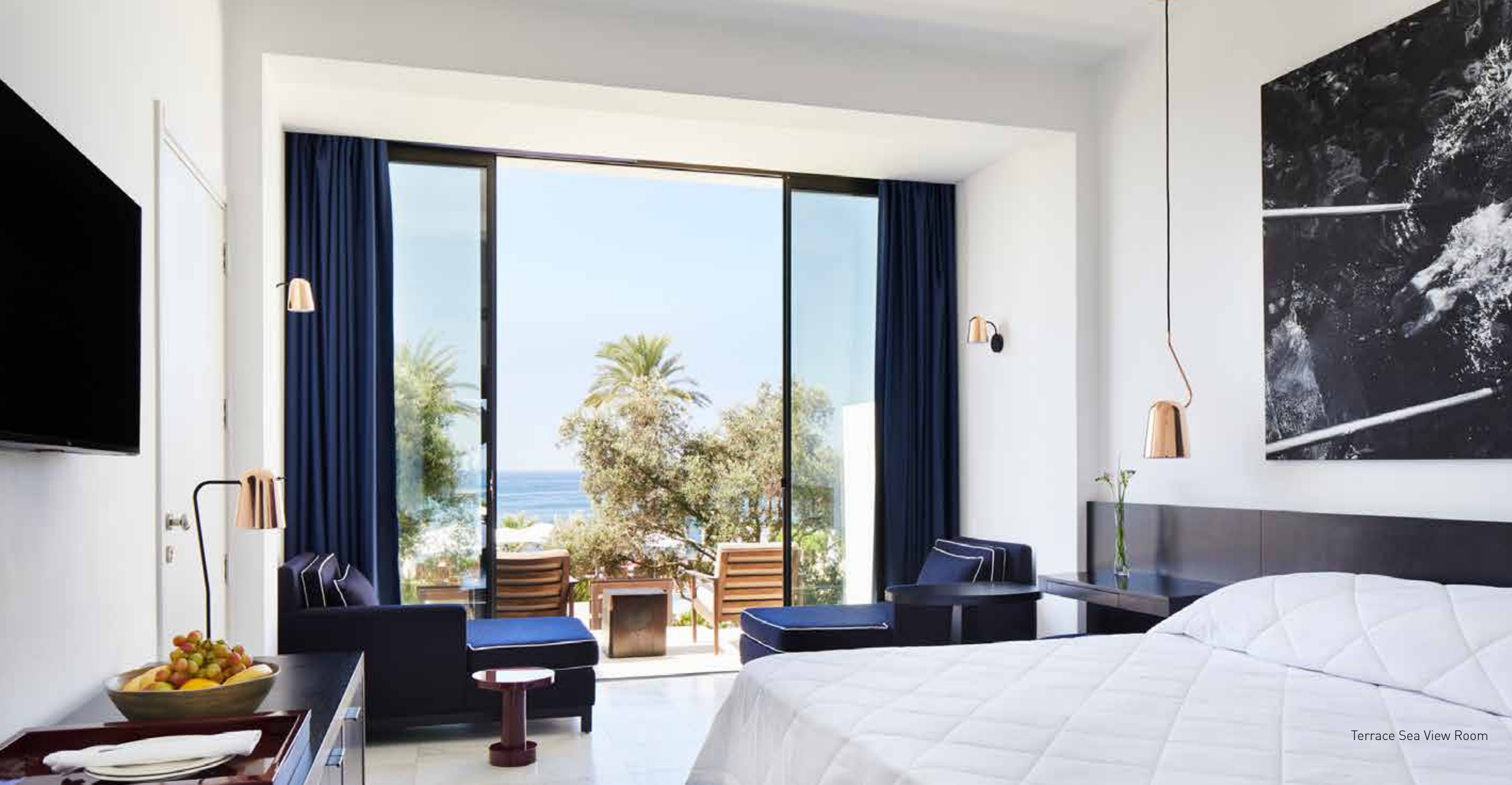
Terrace Sea View Room