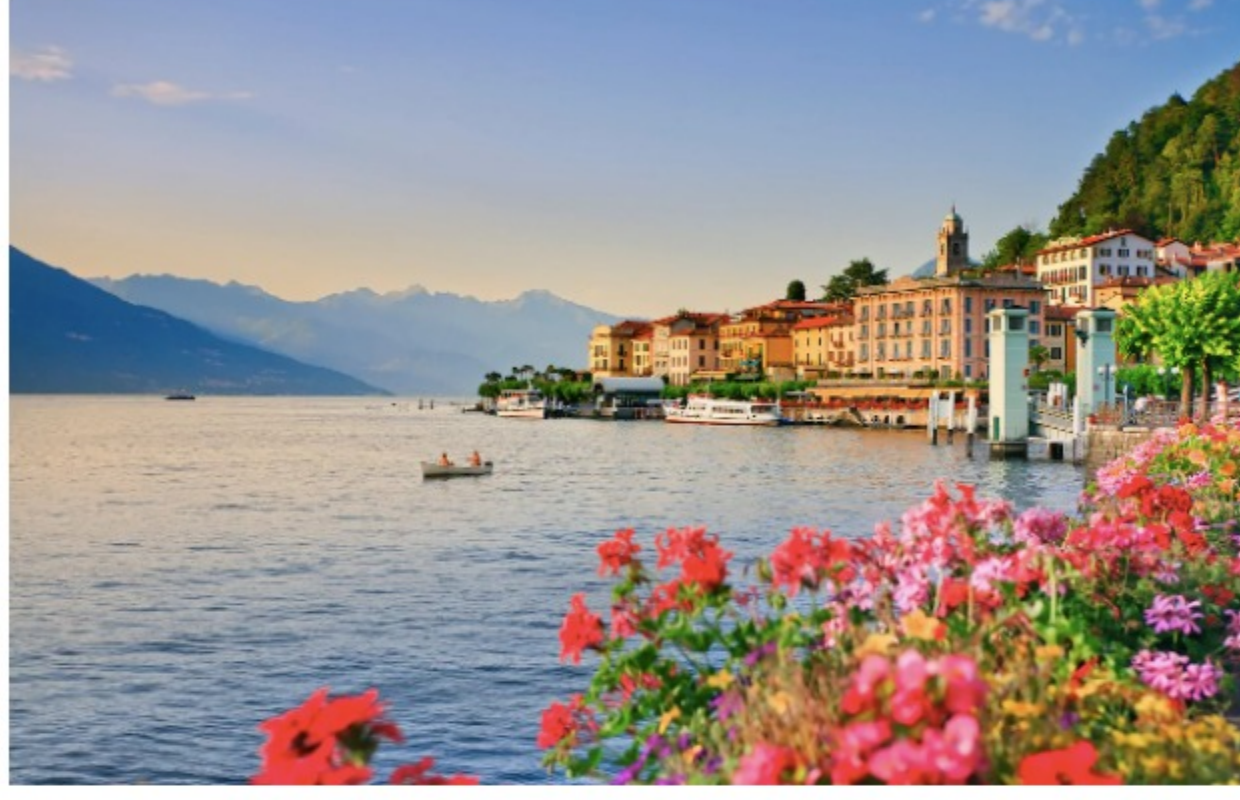
The Italian Lakes will never lose their lustre.