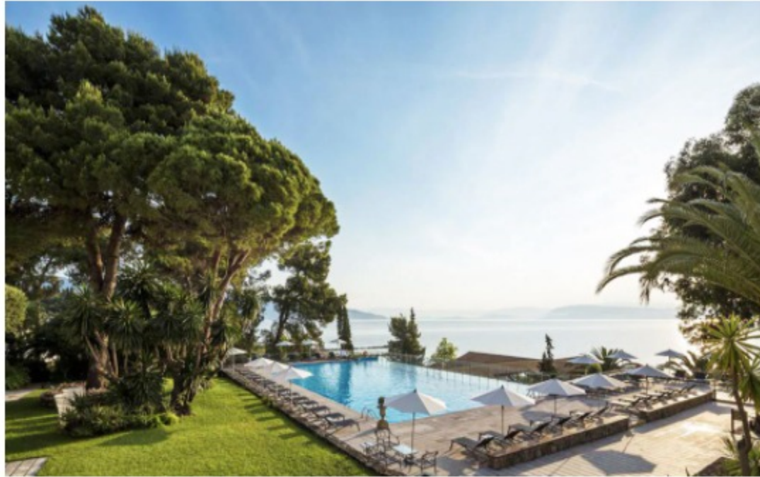
Kontokali Bay Resort &amp; Spa is set on a peninsula and surrounded by olive groves

Seven nights departing September 29, from £614 per person, including Easyjet flights available through Thomas Cook (thomascook.com) .